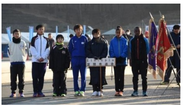
Joint Ekiden relay team