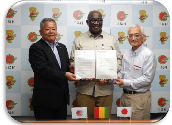
Ambassadors with Mayor of Mishima