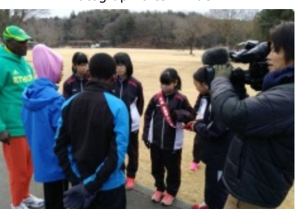
Baton pass training