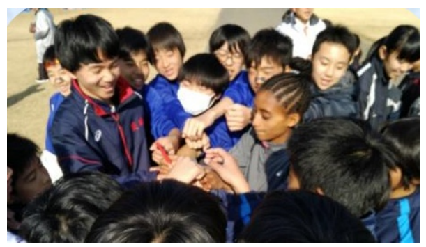
Autograph after Ekiden