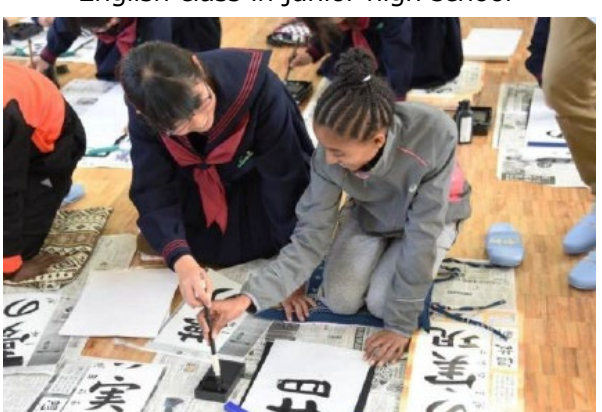
Japanese calligraphy experience